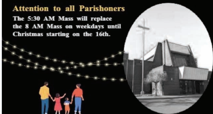
St. Andrew's Catholic Church

The 5:30 AM Mass will replace the 8 AM Mass on weekdays until Christmas starting on the 16th.