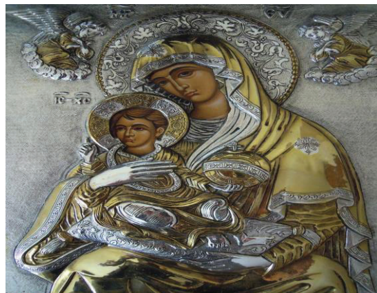
Angelus – Pope Benedict XVI – July 18 th , 2010

"...We are now in the heart of summer, at least in the northern hemisphere. This is the period in which schools are closed and the greater part of the holidays are concentrated. Even the pastoral activities in parishes are reduced and I myself have suspended the Audiences for a while. It is therefore a favourable time to give priority to what is effectively most important in life that is to say, listening to the word of the Lord. We are also reminded of this by this Sunday's Gospel passage with the well-known episode of Jesus' visit to the house of Martha and Mary, recounted by St Luke (10: 38-42).