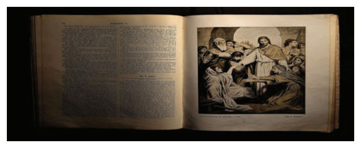
A Passage of Hope: Philippians 4:4-9

"Rejoice in the Lord always; again I will say, Rejoice. Let all men know your forbearance. The Lord is at hand. Have no anxiety about anything, but in everything by prayer and supplication with thanksgiving let your requests be made known to God. And the peace of God, which passes all understanding, will keep your hearts and your minds in Christ Jesus.