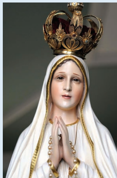
OUR LADY OF FATIMA FROM HOUSE TO HOUSE

The First Holy Communion classes are to formally begin on Saturday, March 26th at St. Andrew's Catholic School . Please check your email for additional information that has been sent through Flocknote.